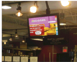
HIRSHFIELD'S HOME DECORATING STORE