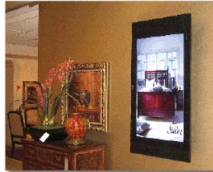
GABBERT'S FURNITURE STORE