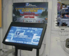
OVERSEAS MILITARY SALES GROUP