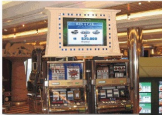
CARNIVAL CRUISE LINES