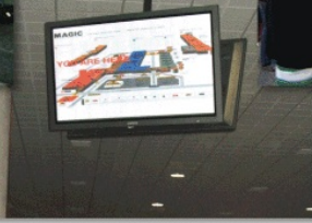
LAS VEGAS CONVENTION CENTER