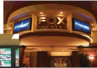
FOXWOODS RESORT & CASINO