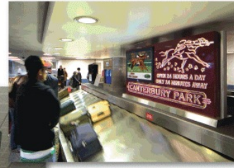
CANTERBURY PARK (MINNEAPOLIS AIRPORT)