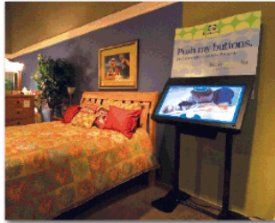
SEALY MATTRESS SHOWROOM