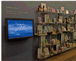
ZIA SLEEP SANCTUARY STORE