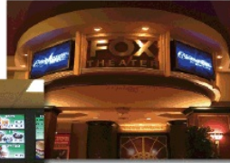
FOXWOODS RESORT & CASINO