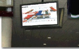
LAS VEGAS CONVENTION CENTER