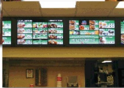
WENDY'S FOUR CROWN