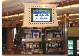
CARNIVAL CRUISE LINES