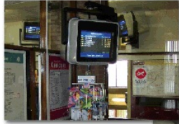
SCOTRAIL - SCOTLAND