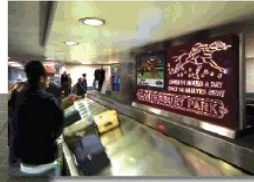
CANTERBURY PARK (MINNEAPOLIS AIRPORT)