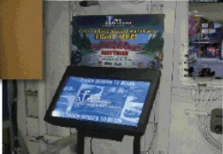
OVERSEAS MILITARY SALES GROUP